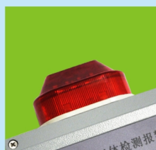
Sound and Light Alarm

Metal shell, solid and durable, easy to install.